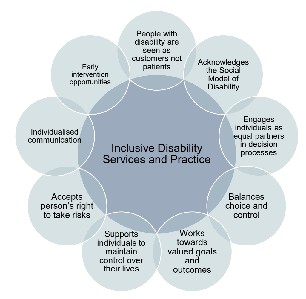
Figure 2.0 Contemporary disability practice principles<sup>1</sup>

The TAC strongly encourages visiting these websites for more information on the disability sector: